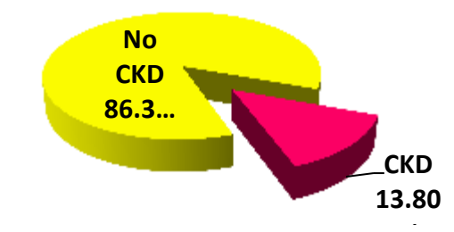
Fig (1) Prevalence of CKD within studied subjects.

During surveillance of CKD within apparently healthy subjects, only 13.8% had CKD Fig (1).