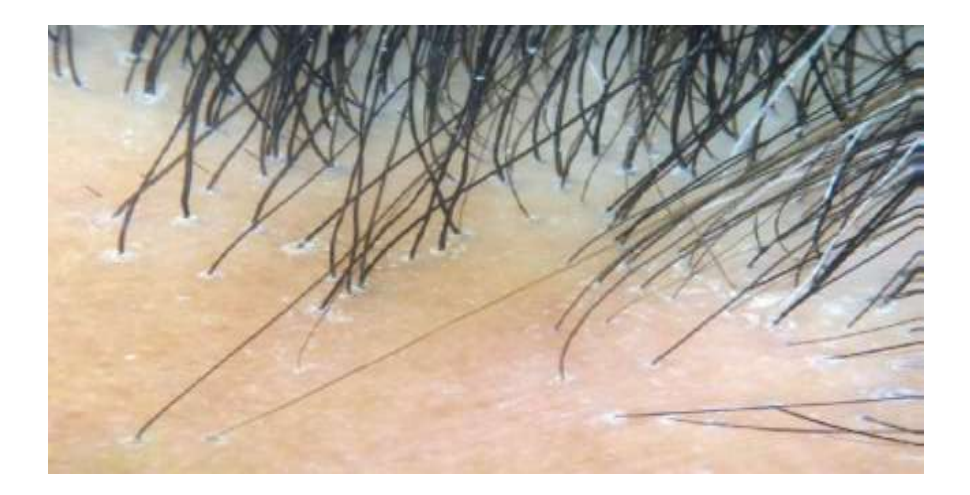
Fig (4) Trichoscopy shows loss of vellus hairs, loss of follicular opening, perifollicular scaling, inter-follicular scales and lonely hairs.