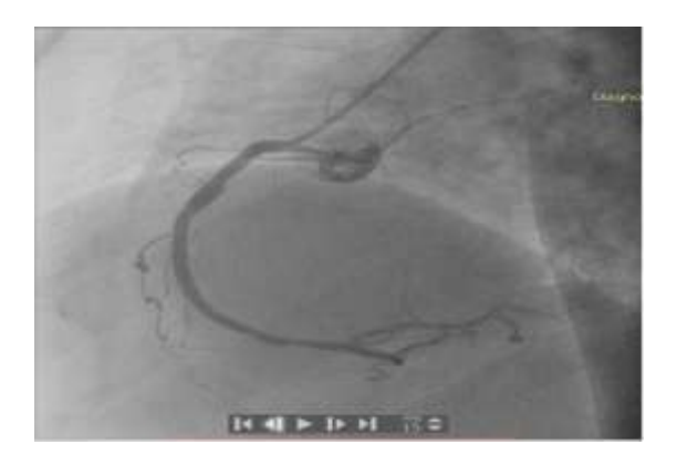
Fig (2) post intervention angiography in ectatic RCA