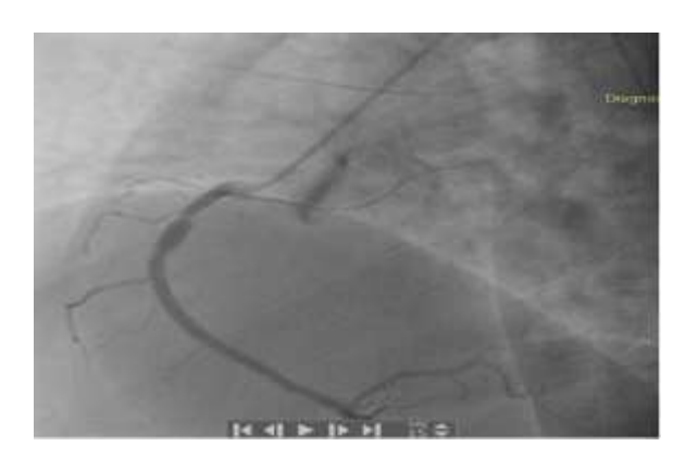
Fig (1) Ectatic RCA preintervention