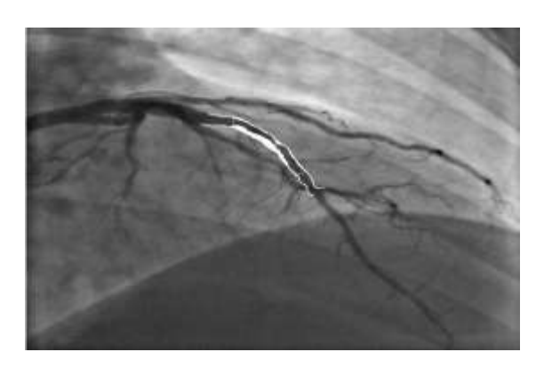
Fig (3) tapered LAD angiography.