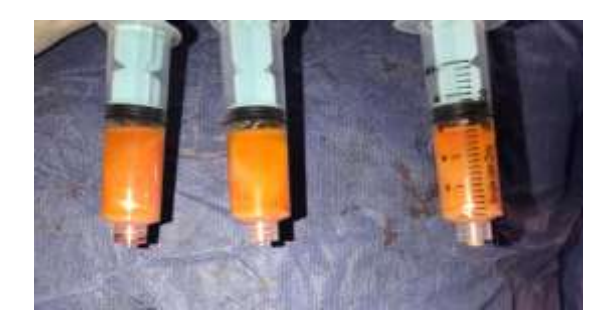
Fig (8) Fat syringes after filtration and getting rid of the hematic layer: which are ready for fat injection.

After the filtration process, an average volume of 220 ml (range: 70–450 ml) was available for lipo-filling. This is equivalent to 20% of the initially harvested volume.