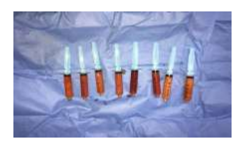
Fig (6) lipoaspirate collection in syringes before fat processing