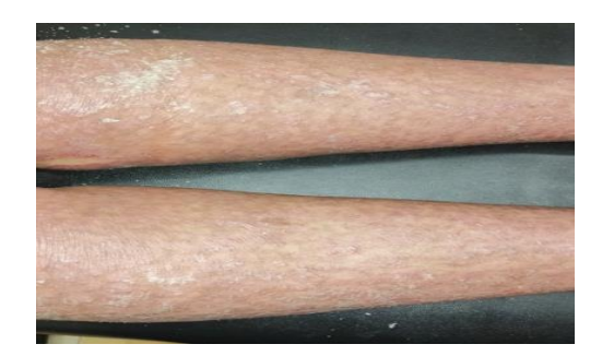
Fig (1) participant with severe psoriasis

The collected data was revised, coded, tabulated and introduced to a PC using Statistical package for Social