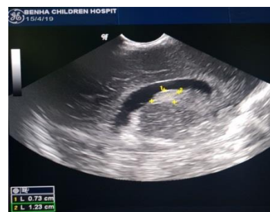
Fig (3) Sagittal image shows IVH GI in case 1.

Five Days Later Complicated By Intra Ventricular Hemorrhage grade [I].