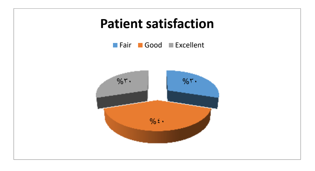
Fig. (2): Pie chart illustrating patient satisfaction of the studied group.

treatment regarding Vancouver scale score results [p<0.05] where post-treatment results showed lower mean values when compared to pre-treatment mean values. The mean percent of change was 44.93\pm16.13 with median 50 [33.3-57.14].